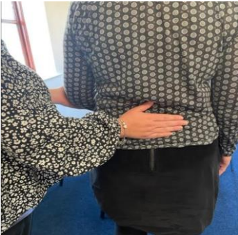
Reference: Guiding 3