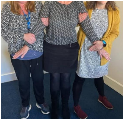
Reference: Straight arm immobilisation 6