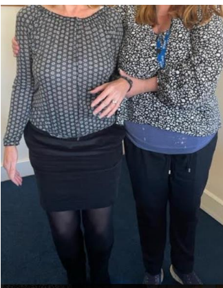
Reference: Escort 4