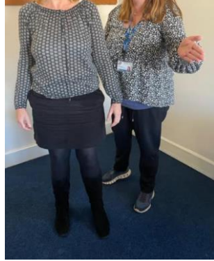
Reference: Prompting 2