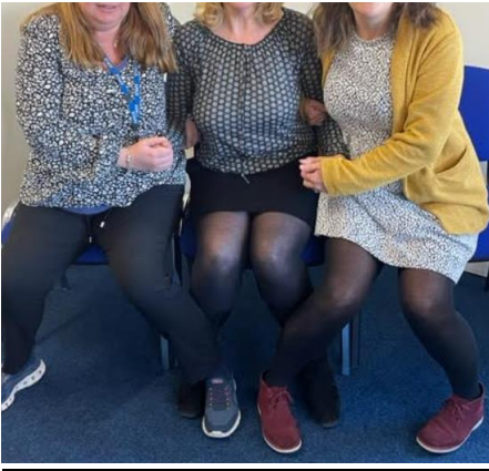
Reference: Seated kicking position 8