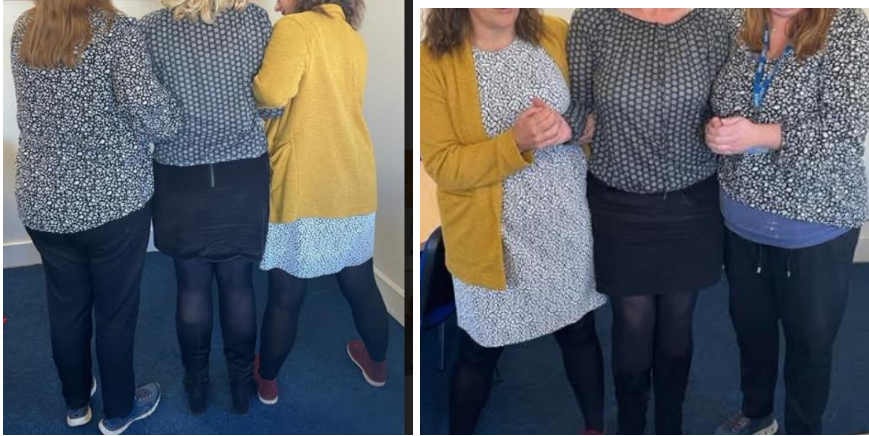
Reference: Double cup hold 5