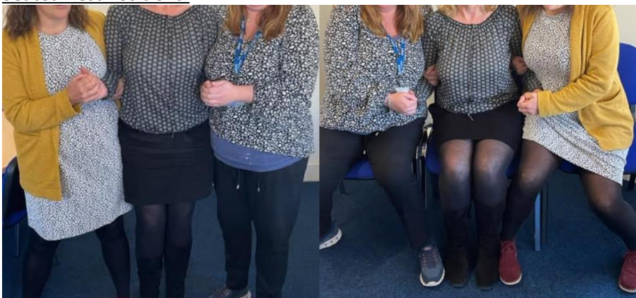
Reference: Seated rest position 7